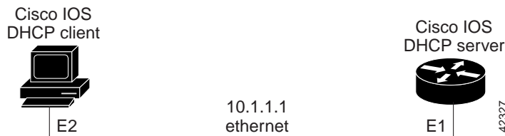
Figure 16 Topology Showing DHCP Client with Ethernet Interface

On the DHCP Server, the configuration is as follows: